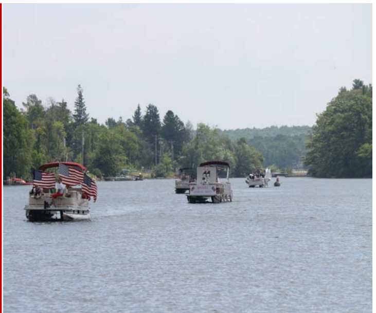
Fourth of July Boat Parade