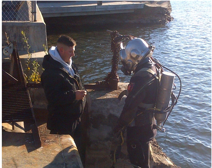
Picture above shows Diver from Seaway Dive Services on the November 4,2013 MCA Dam Dive