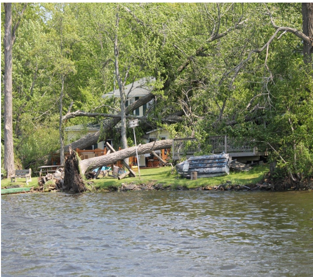
Mariaville Tornado Damage 2013

In addition to the upcoming inspections it should be noted please be careful of flushable items such as female products, baby wipes, and items that claim to be sewer safe. Pumps are being clogged with these items and it is notices that this usually occurs when family and friends visit our homes. (family parties) The grinder pumps are not equipped to grind these types of items. For those of us on gravity feeds your waste goes to a pump station and the items mentioned above eventually make it to a grinder pump.