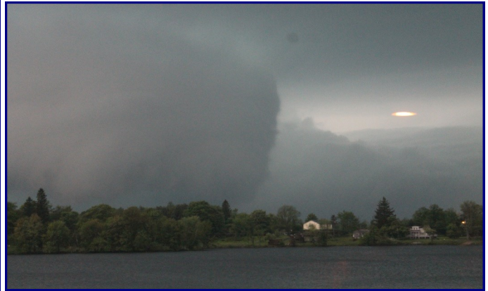
Mariaville Tornado Summer 2013— Three minutes before the destruction

I look forward to serving you as the new Town Supervisor and continuing to be a neighbor and friend in this community.