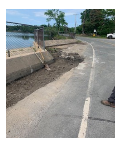
Road work on being Completed by Schenectady County DPW