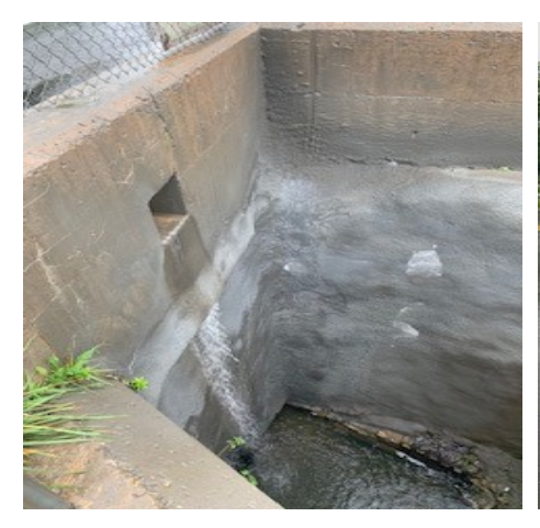
Newly Shot created repaired spillway