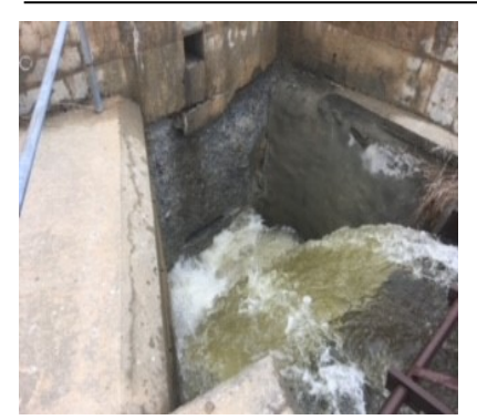
Deteriorated Spaulding Spillway