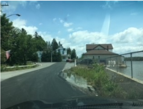
Roadway overgrown and muddy by Dam