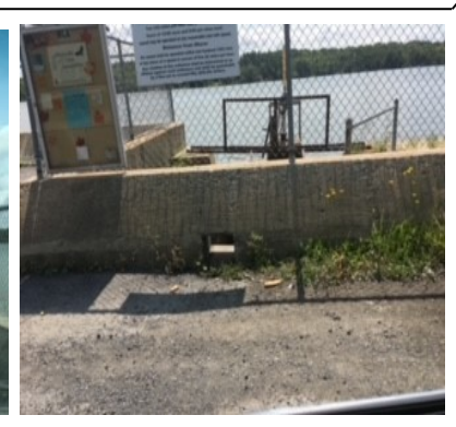
Road in front of Dam Holding Water causing deterioration to dam face