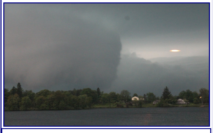
Mariaville Tornado Summer 2013— Three minutes before the destruction

I look forward to serving you as the new Town Supervisor and continuing to be a neighbor and friend in this community.