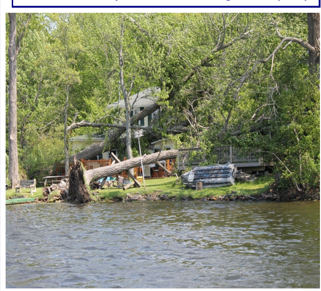
Mariaville Tornado Damage 2013

In addition to the upcoming inspections it should be noted please be careful of flushable items such as female products, baby wipes, and items that claim to be sewer safe. Pumps are being clogged with these items and it is notices that this usually occurs when family and friends visit our homes. (family parties) The grinder pumps are not equipped to grind these types of items. For those of us on gravity feeds your waste goes to a pump station and the items mentioned above eventually make it to a grinder pump.