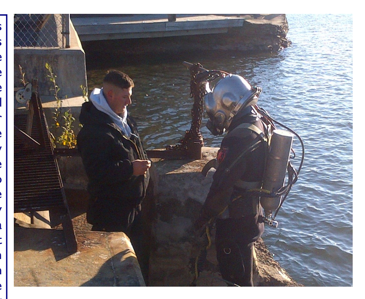
Picture above shows Diver from Seaway Dive Services on the November 4,2013 MCA Dam Dive

All of these issues are being taken care of by your membership and your donations. Taking care of the dam is not cheep. Engineering studies are running in the neighborhood of $15,000.00, the divers were $2,100.00, the estimates on the valve repair range from $6,000.00-$16,000.00 depending